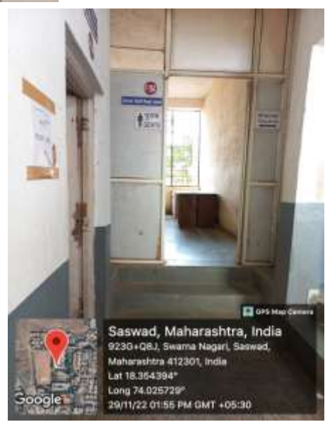
Disabled-friendly washrooms at ground and first floor